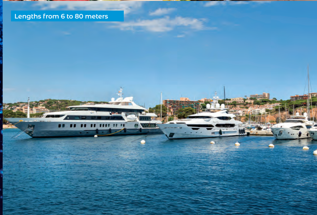
Lengths from 6 to 80 meters