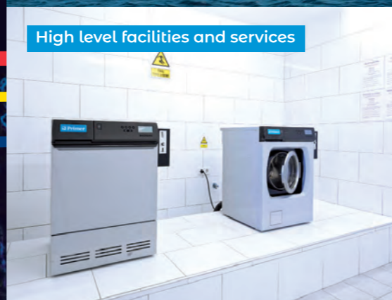
High level facilities and services