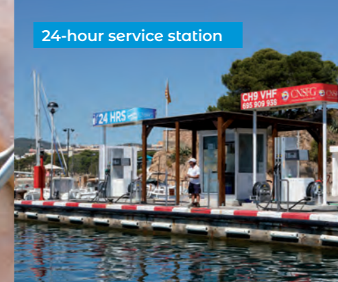
24-hour service station