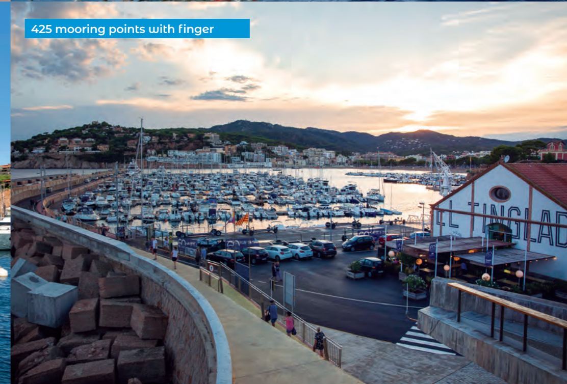
425 mooring points with finger